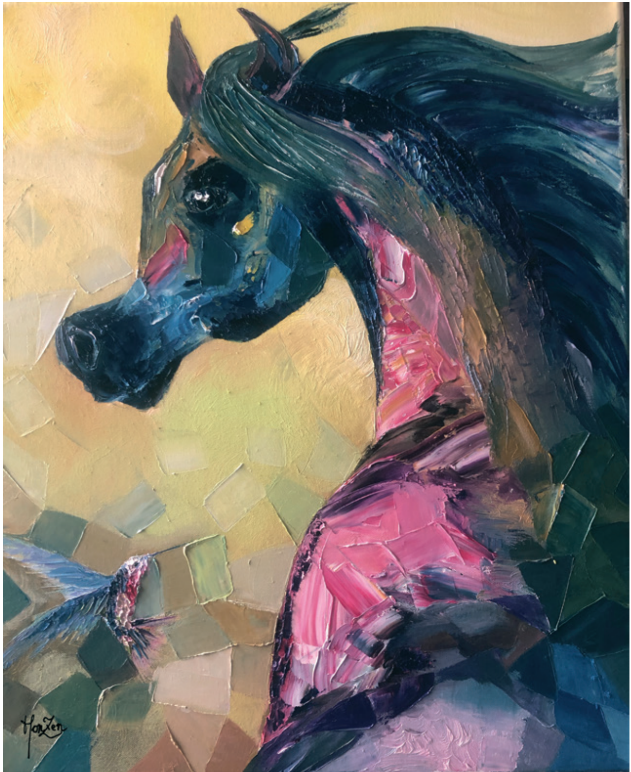
Lady Bird (50x60cm)